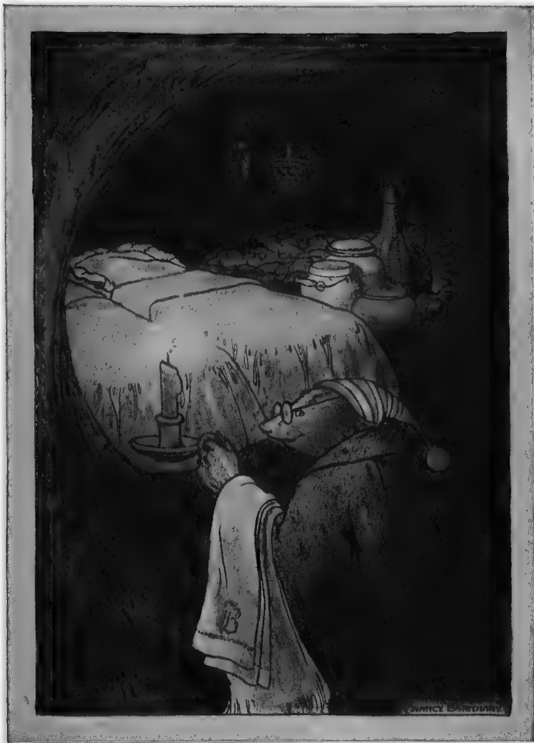
THE TWO LITTLE WHITE BEDS LOOKED SOFT AND INVITING