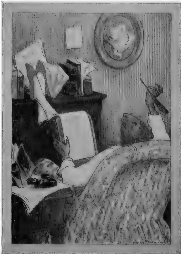
HE SOMETIMES SCRIBBLED POETRY