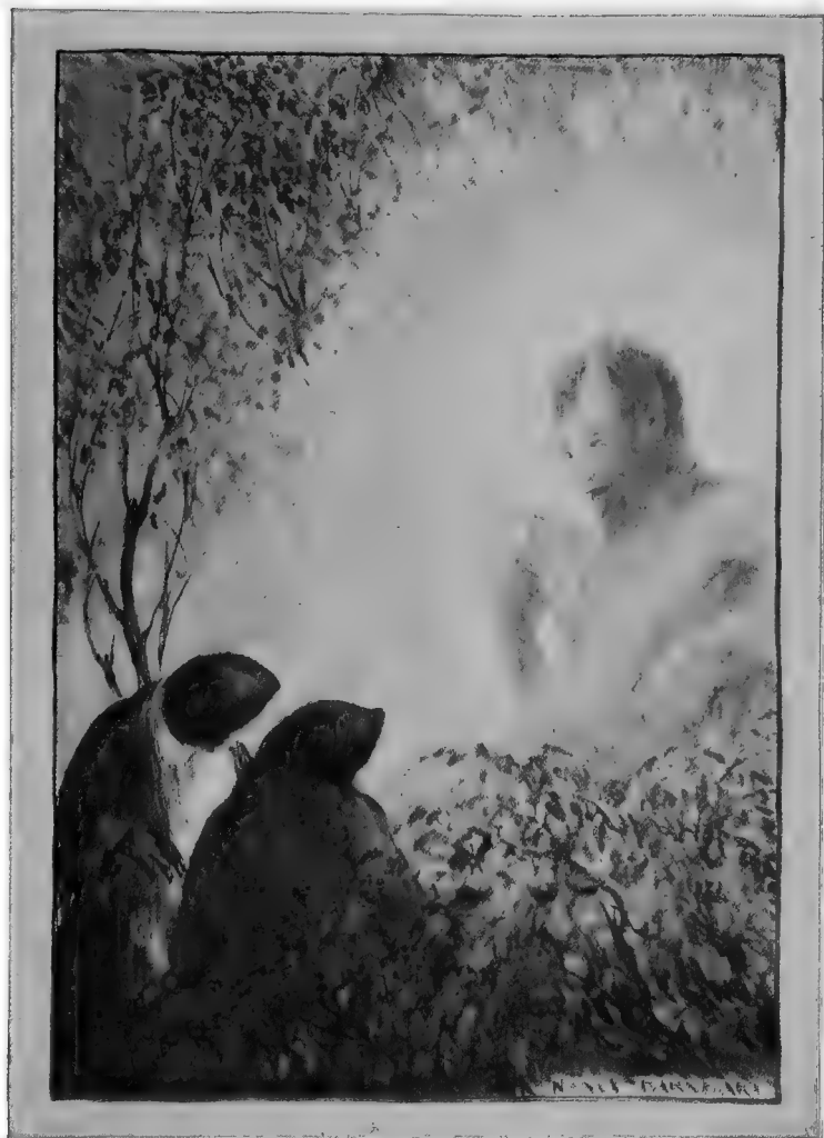
LOOKED IN THE VERY EYES OF THE FRIEND AND HELPER