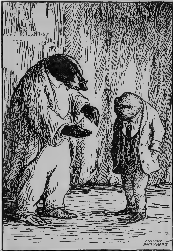
LONG-DRAWN SOBS FROM THE BOSOM OF TOAD