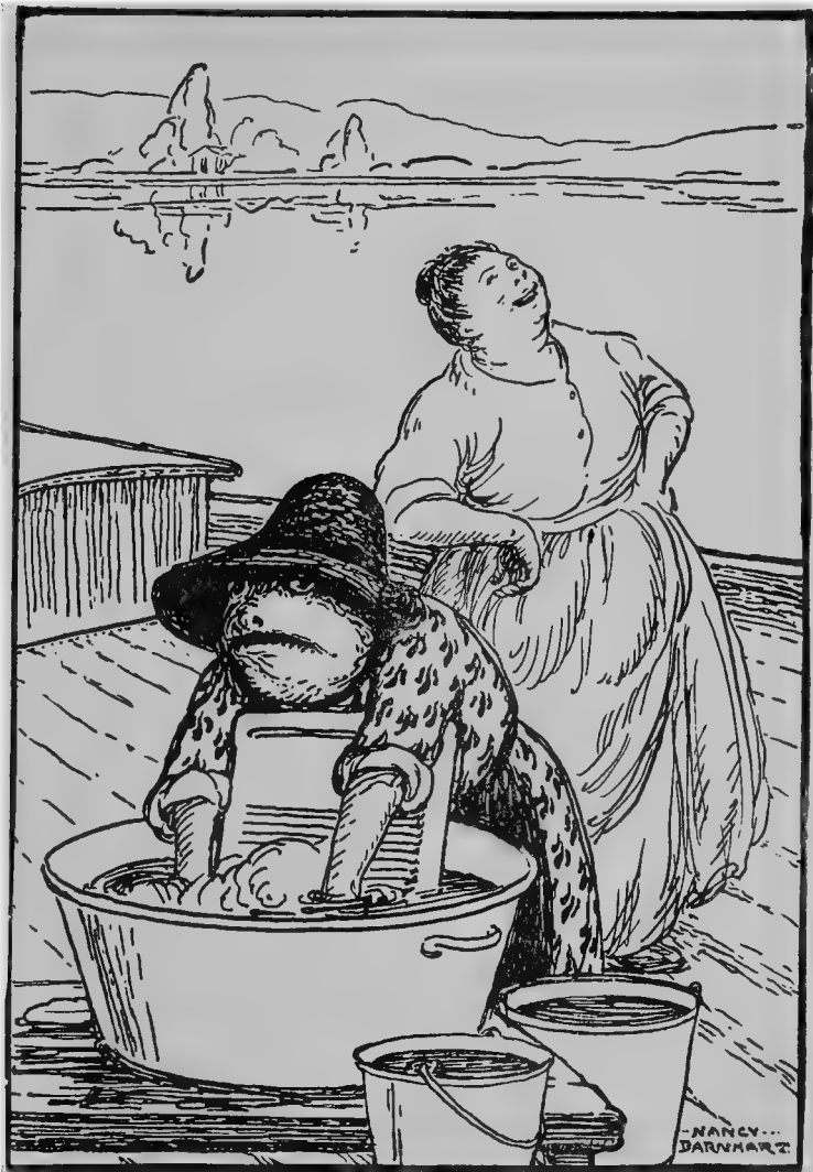
LOST THE SOAP, FOR THE FIFTIETH TIME.