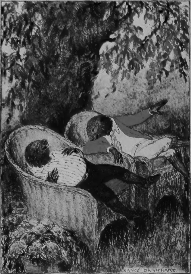
OUT ON THE LAWN, ROARING WITH LAUGHTER