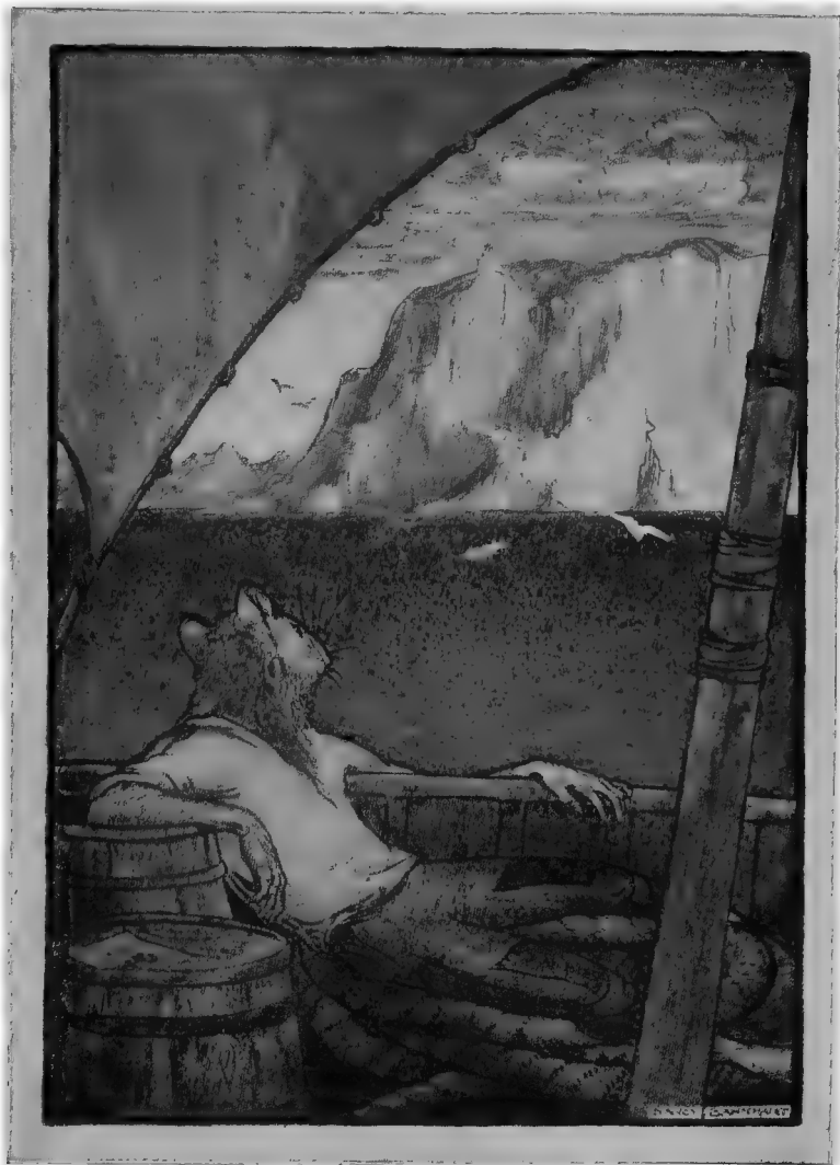
THOSE WERE GOLDEN DAYS