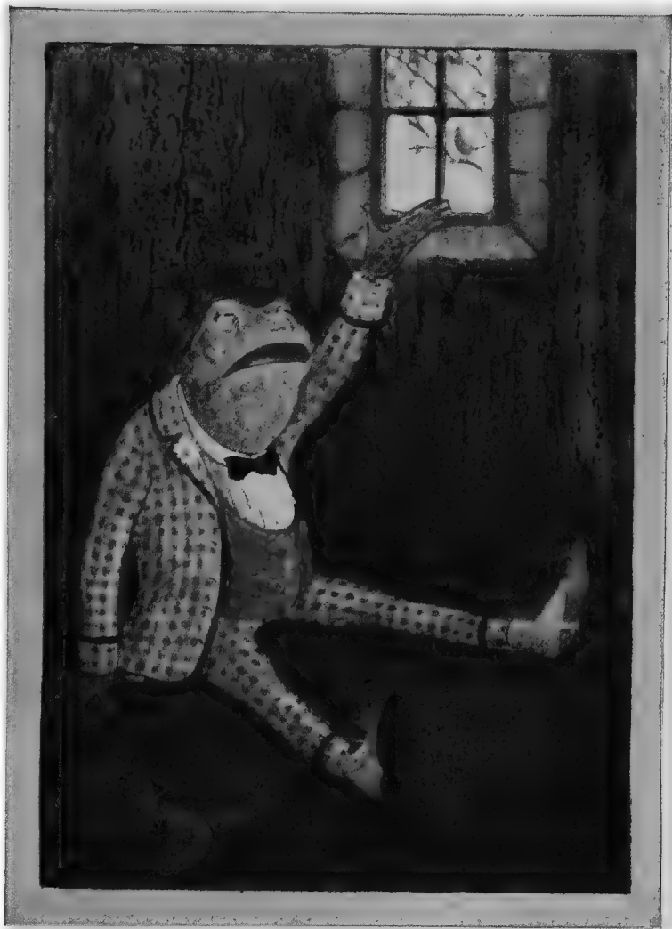
O UNHAPPY AND FORSAKEN TOAD