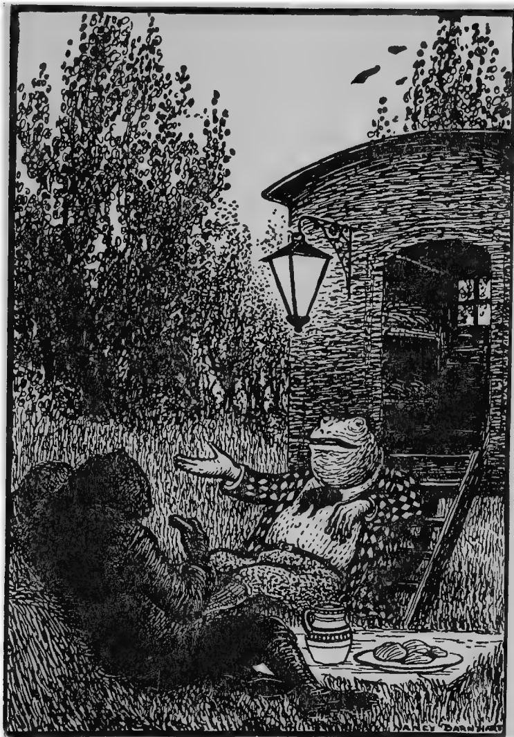
TIRED AND HAPPY AND MILES FROM HOME