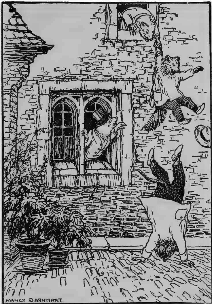
THE WILD WOODERS HAVE BEEN LIVING IN TOAD HALL